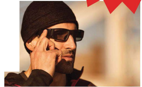
Receive work instructions on the job