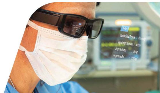
Immediate mobile access to patient data & tests