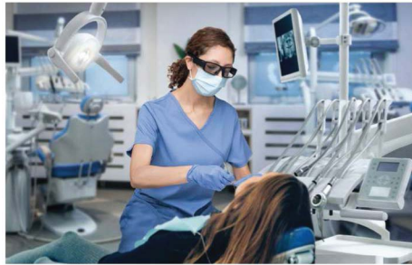
Real-time, hands-free information