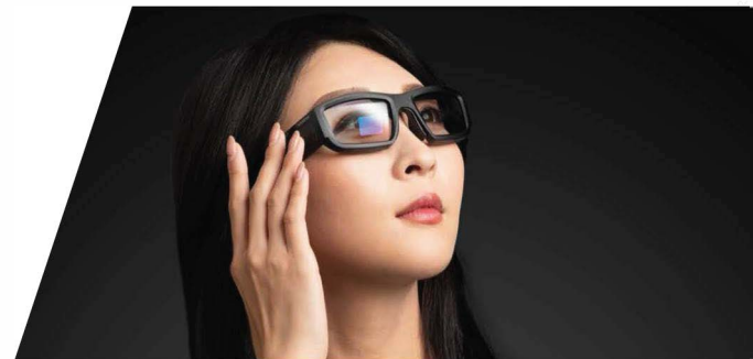
Operate the Vuzix Blade with your voice or the built-in touchpad for silent control

The Vuzix Blade are the first Augmented Reality (AR) Smart Glasses featuring advanced waveguide optics for hands-free mobile computing & connectivity.